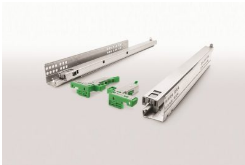
FGV N665H EXCEL RUNNERS