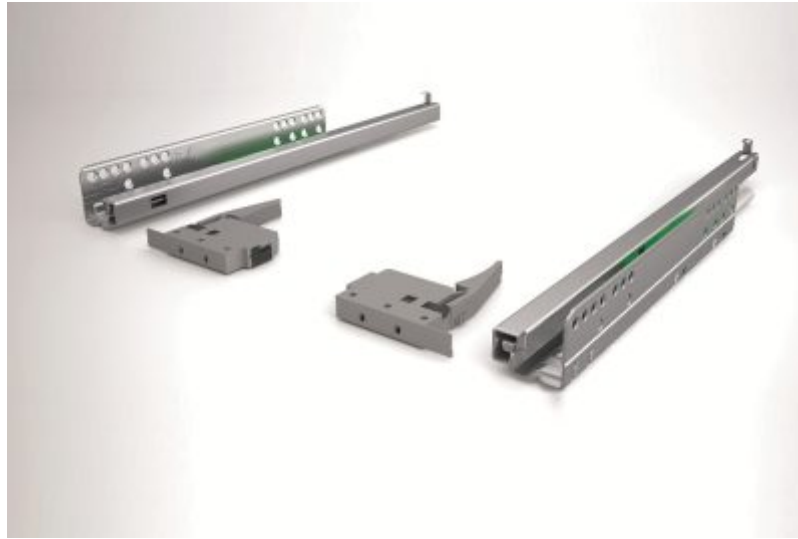
FGV N550H EXCEL RUNNERS